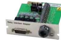
Relay Interface Card