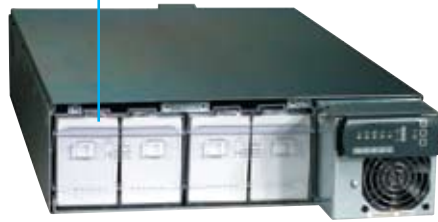
5000/6000 VA rackmount model

Hot-swappable electronic modules—replace electronics modules without shutting down connected equipment (available on 5000 VA to 6000 VA models)