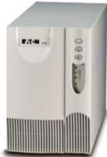
5125 tower model 1000 to 2200 VA