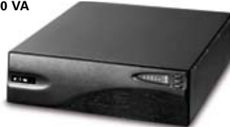
5125 rackmount 5000 to 6000 VA

Now featuring a 3-year warranty with product registration!